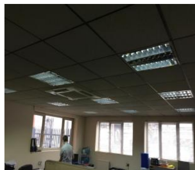
Office - Before LED Upgrade

'Perfect Sense Energy took our brief and designed an LED lighting system that provides a naturally bright, energy efficient environment that everyone agrees is a vast improvement on the old, inefficient traditional lighting. In addition to the impressive financial benefits, LED lighting is a vast improvement that is helping our company to enhance our premises.'